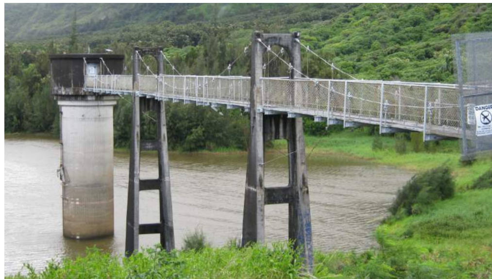
Nuuanu Reservoir No. 4 features a tower through which water drains from the reservoir pool.